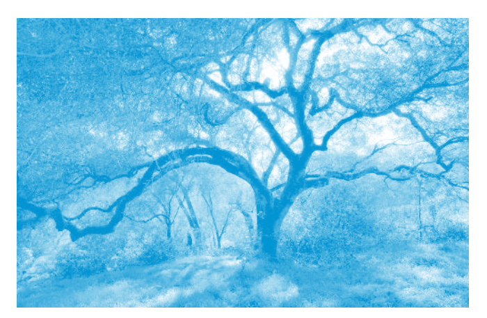
Live Oak Canopy (2014 Best in Show, Alicia B. Warwick)