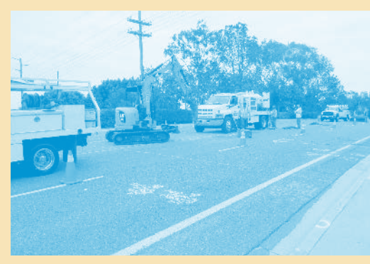
OMWD and its contractor, SC Valley Engineering, working along Via Cantebria in Encinitas.