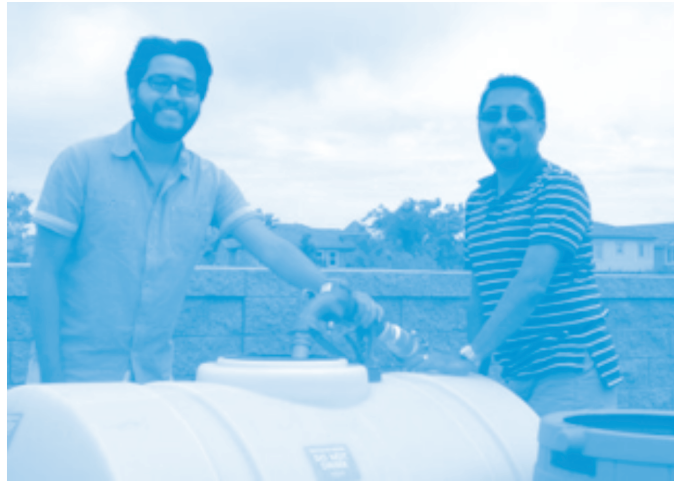
Located at Campana Avenue & Camino San Thomas in the 4S Ranch area of San Diego, the fill station is currently open Wednesday and Friday from 12:00 pm. to 4:00 p.m., and Saturday 8:00 a.m. to 2:00 p.m., excluding holidays

Recycled water is wastewater that has undergone purification and disinfection processes to meet strict water quality standards. It is being temporarily offered to OMWD customers to reduce the consumption of potable water used for outdoor irrigation. Find out more information at www.olivenhain.com/fillstation .