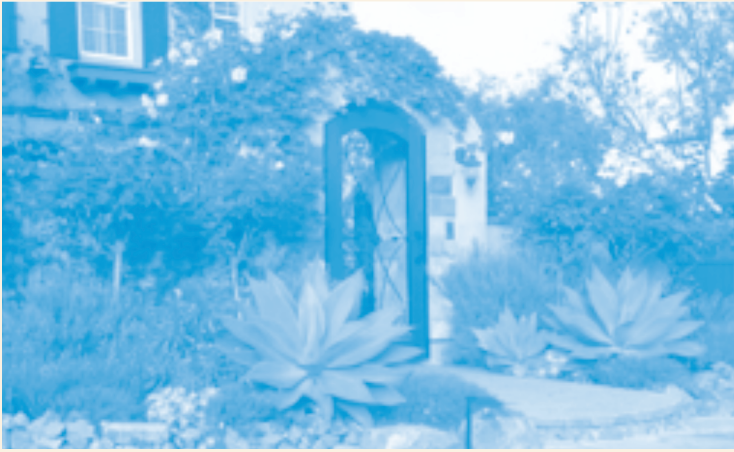
California-friendly means more beauty, with less water

Make a trip to Elfin Forest Recreational Reserve's beautiful Interpretative Center for a free workshop on Thursday, September 22, from 4:00 p.m. to 6:30 p.m. Learn how to create a sustainable landscape that uses native and California-friendly plants, focuses on water use efficiency, and takes a watershed approach to landscaping. Refreshments and informational materials will be provided. Find out more or reserve your seat at www.olivenhain.com/events .