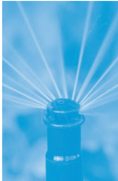
Rebates are available for water-efficient devices such as rotating sprinkler nozzles

OMWD customers are now able to irrigate as often as their landscape requires provided that runoff does not occur and it has been at least 48 hours since measurable rainfall. There are no restrictions limiting irrigation to specific days or times; however, the most advantageous time to irrigate is before 8:00 a.m. or after 6:00 p.m. to prevent water loss from evaporation or wind.