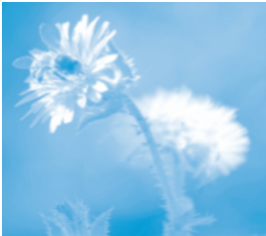
The Pollinator by Karrie McGuigan

There is still time for amateur photographers of all ages to submit entries in the Elfin Forest Recreational Reserve Photo Contest online before the September 5, 2016 deadline. Entries must feature the reserve as their subject or be taken within the reserve from any trail. Visit www.olivenhain.com/photo for official contest rules and to upload your entries.