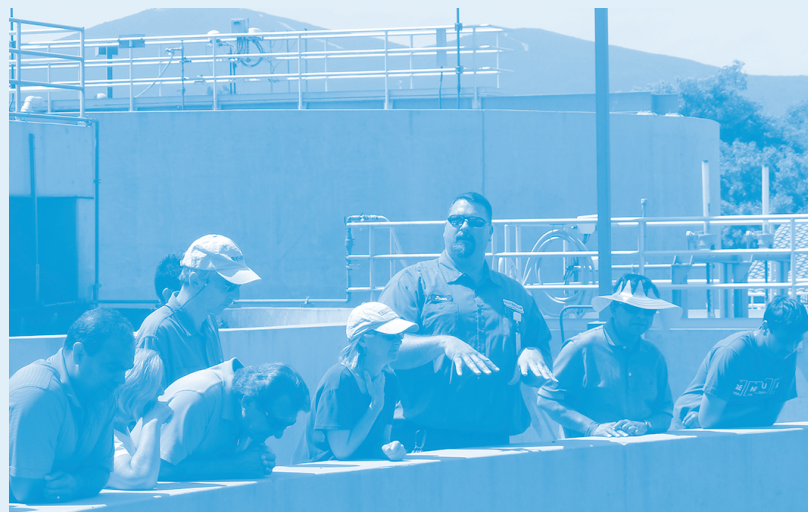
Facility tours will be held at 10:00 a.m. and 11:00 a.m.

Learn how OMWD transforms wastewater into a renewable water supply for school fields, street medians, and other landscape areas at our annual open house on Saturday, August 20, from 9:00 a.m. to 12:00 p.m. It takes approximately 40 minutes to follow the path that water takes through the reclamation process. There will be information booths, refreshments, free prize drawings, and childrens' activities so please stop by with your family! The facility is located at 16595 Dove Canyon Road in San Diego.