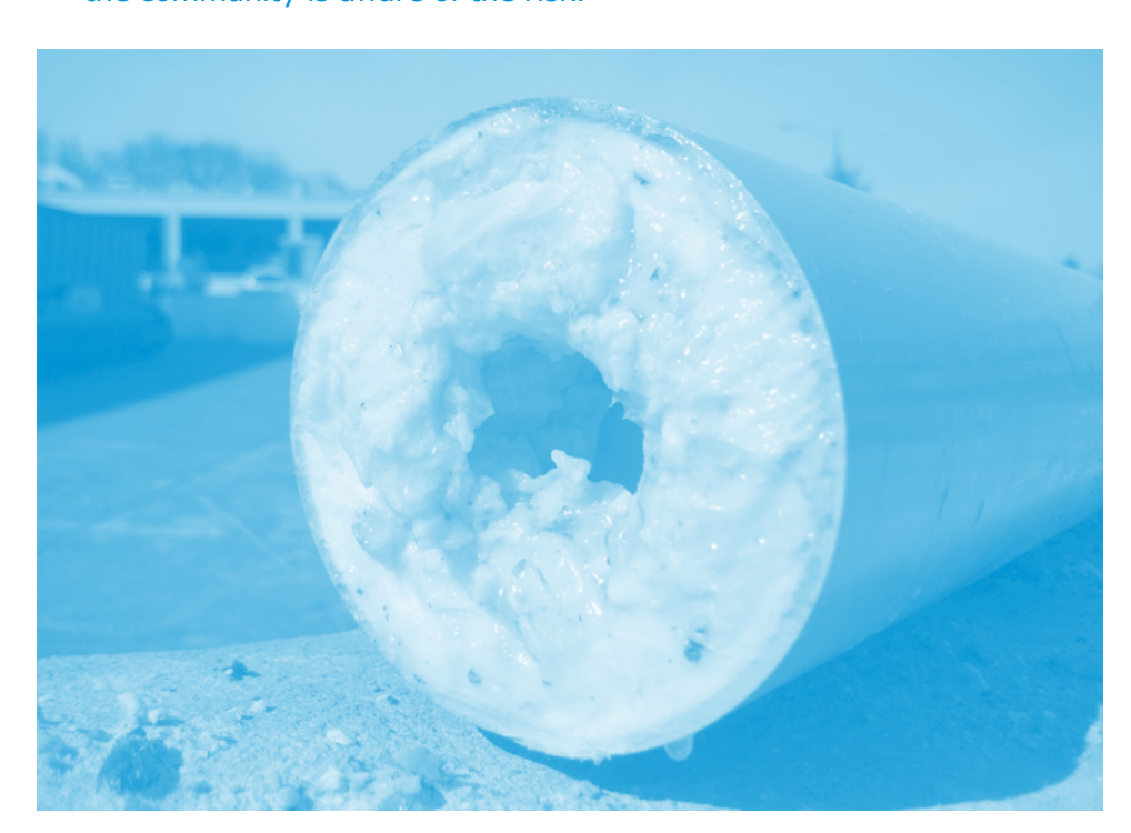
Fats, oils, and grease help to clog municipal sewer pipes creating blockages that can lead to backups and spills.