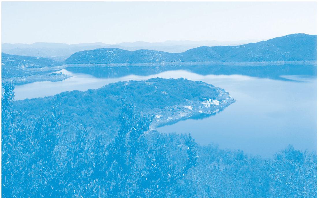
Located within our EFRR, Olivenhain Reservoir stores over seven billion gallons of water for emergency use

Elfin Forest Recreational Reserve - Our partnerships with the San Diego County Water Authority, the U.S. Department of the Interior Bureau of Land Management, and the Escondido Creek Conservancy continued to flourish in 2016. EFRR deployed 79 docents to operate the Interpretive Center Honoring Susan J. Varty and patrol trails, hosted more than 1,700 schoolchildren, and welcomed more than 120,000 visitors.