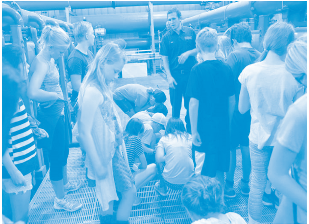
Tour attendees witness water treatment through ultra-filtration membrane technology

Operating an efficient water system requires a specialized team of employees and a variety of facilities throughout OMWD's 48-square-mile service area. OMWD customers are invited to sign up for one of four public tours scheduled in 2017 to see firsthand how clean, safe water arrives at your tap, how recycled water is replacing the use of drinking water on landscape, and the benefits of OMWD's operation of our Elfin Forest Recreational Reserve. To learn more, visit www.olivenhain.com/events . Our next tour will be held on Thursday, January 12, 2017.