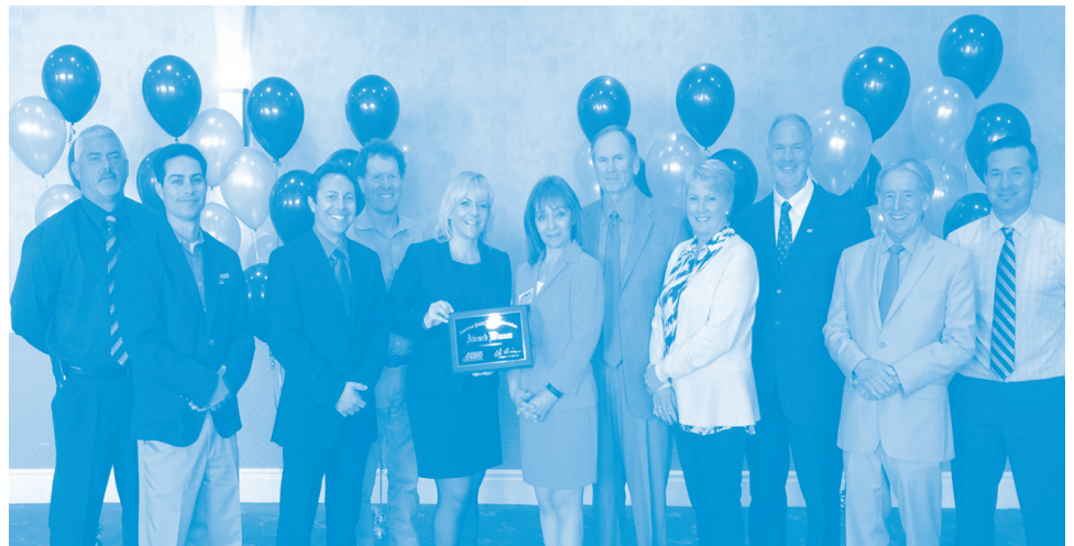
OMWD accepts two awards for recycled water projects