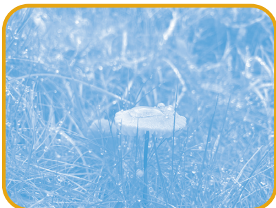
PLANTS - "Mushroom" Adrian Flores