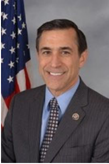
Rep. Darrell Issa