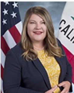
Amb. Tasha Boerner

District Office 12396 World Trade Drive, #118 San Diego, CA 92128 858-675-0760