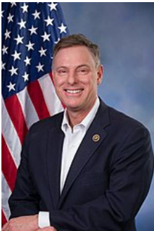
Rep. Scott Peters

District Office 2204 El Camino Real, #314 Oceanside, CA 92054 760-599-5000