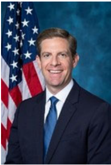
Rep. Mike Levin

District Office 221 W. Crest Street, #110 Escondido, CA 92025 760-304-7575