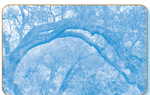
"Nature's Rainbow" by Melody Colombo

Bring your camera and discover your creative side while exploring our 748-acre reserve. The reserve offers approximately 11 miles of hiking, mountain biking, and equestrian trails that offer a wide range of photographic opportunities.